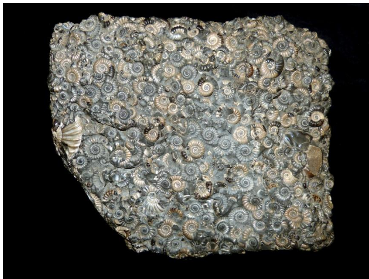
Lower Jurassic ammonites ( Promicroceras ) collected from Somerset, specimen approximately 20cm across (NHMUK PI C 2138)